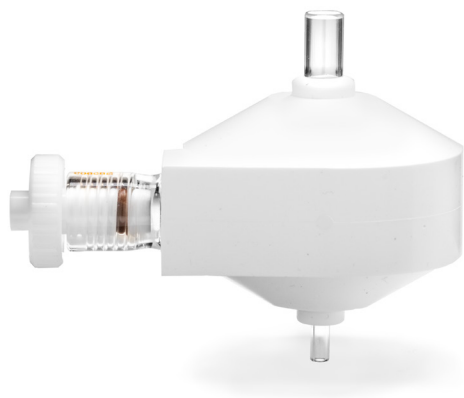
Figure 2. The removable glass double pass spray chamber is covered in a thermally conductive polymer layer that is easily cleaned.

The IsoMist is a rugged, compact unit that is easily removed for cleaning and routine maintenance.