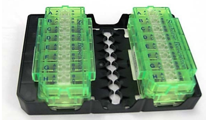
Figure 3 | Seahorse XFp Carrier Tray holding 2 cartridges supported by miniplates.

Seahorse XFp Carrier Trays are included with each instrument. These carriers can hold two (2) Seahorse XFp cartridge/miniplate assemblies or three (3) miniplates without cartridges. They provide easier handling and incubation of plates and cartridges as well as compatibility with microplate-based equipment.