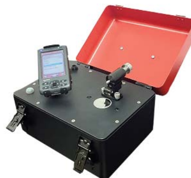
Figure 2. The Agilent 4500 Portable FTIR is a battery-powered, mid-IR spectrometer that, like the Cary 630, is well-suited to pharmaceutical analysis. The 4500 system features a dedicated sample interface, such as the diamond ATR, is fully mobile, and designed for deployment in field locations.