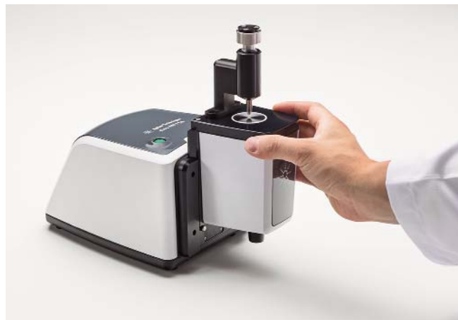
Figure 1. The Agilent Cary 630 FTIR equipped with single reflection diamond ATR is well-suited to analysis of pharmaceuticals in QA/QC and field laboratory environments. The system's compact size, interchangeable sampling interfaces, method driven software, and IR spectral database search capabilities enable routine identification and verification for a wide variety of compounds.

For the FTIR measurements, the researchers measured the ground powders in the 4,000 to 650\text{ cm}^{-1} region and recorded 32 coadded interferograms. A spectral library that consisted of a subset of the reference standard, API containing tablets, and placebo tablets was created, and the remaining tablets were searched against this library. A hit-quality index value was used to indicate how well the sample matched the library reference spectra.