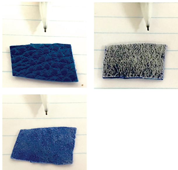
Figure 1. Different layers of a billfold tested for phthalates.

As another example of bulk versus surface and how the dilution effect influences results, we examined the billfold in Table 3 in closer detail. The billfold consisted of a PET fabric layer and a PVC polymer layer (Figure 1). A GC/MS analysis of a 0.2624 g bulk sample yielded a DEHP level of 4.462 weight % or 0.0117 g DEHP. For the FTIR analysis, we mechanically separated the two layers and measured the PVC layer, which yielded a DEHP level of 8.99 weight %, or nearly twice the GC/MS value. Since the PET layer, which had been removed from the 0.2624 g sample, weighed 0.1907 g, the weight % of DEHP, discounting the dilution effect by the PET layer, was 0.0117/0.1907 = 6.13 weight %. The recalculated GC/MS result (6.13 %) agreed more closely with the FTIR measurement (8.99 weight %). Differences between the two results are mostly related to the fact that some of the PET fibers were imbedded in the PVC layer and could not be removed during the mechanical separation. The remaining difference in concentration is explained by known variables such as solvent extraction efficiency, sample preparation, and mass dilution due to inorganic fillers in the sample.