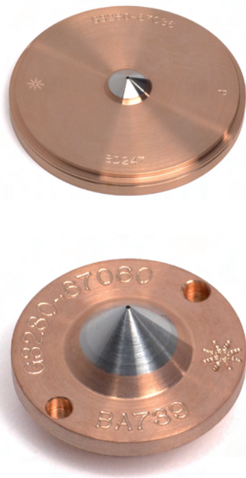
Figure 1: Used platinum cones can now be returned for a trade-in credit and recycling.

Periodic cleaning of the cones is essential to remove any build-up of foreign matter and maintain peak performance. Even with repeated cleaning, the cones will eventually become unusable, after extended use.