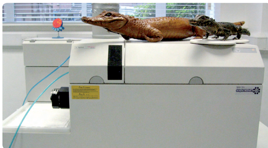
Figure 2. Alligator and dwarf crocodile with Agilent 7500cs ICP-MS

The learning department wished to use two crocodylian specimens (an alligator (pictured Figure 1 and 2)