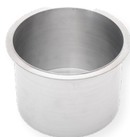
Cryogenic Processor Inner Bowl, 5 L