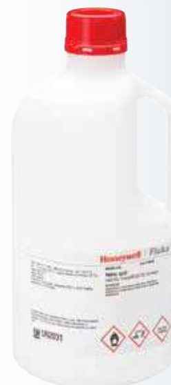
Honeywell Fluka - Nitric Acid TraceSELECT 84385-2.5L

The reduction of metals into mercury is more favourable than reduction to the solid-state electrode. Further on there is always a clean new Hg electrode surface available for each measurement.