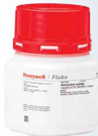
Honeywell Fluka - Ammonium Acetate TraceSELECT 73432-100G

For more information, visit: lab-honeywell.com/traceselect