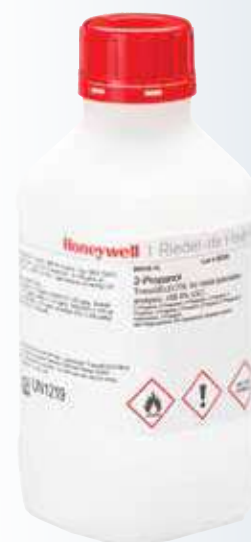
Honeywell Riedel de Haën - 2-Propanol TraceSELECT 04516-1L

Performing a speciation analysis in a complex mixture involves separation, identification, and characterization of various forms of elements in the sample. The most commonly used strategy for speciation analysis is to perform a separation step before a generic detector.