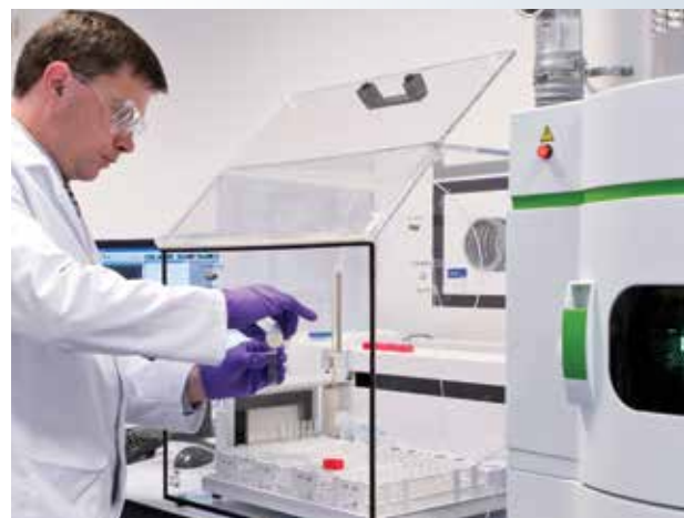
Atomic Emission Spectroscopy Analysis

We employ a large variety of modern analytical methods, such as inductively coupled plasma atomic emission spectroscopy (ICP-OES), inductively coupled plasma mass spectrometry (ICP-MS), flame atomic absorption spectroscopy (AAS) and graphite furnace AAS. This allows for specifically tailored control and analysis procedures for each product.