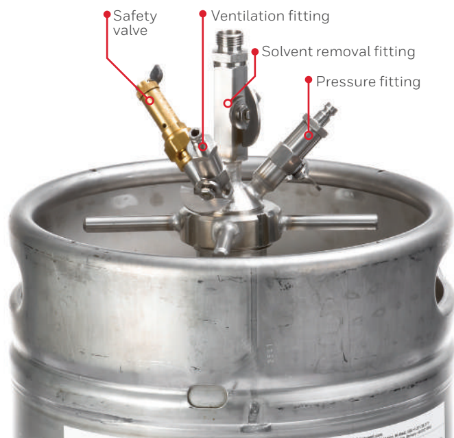
Dispensing head for containers with integrated dip tube