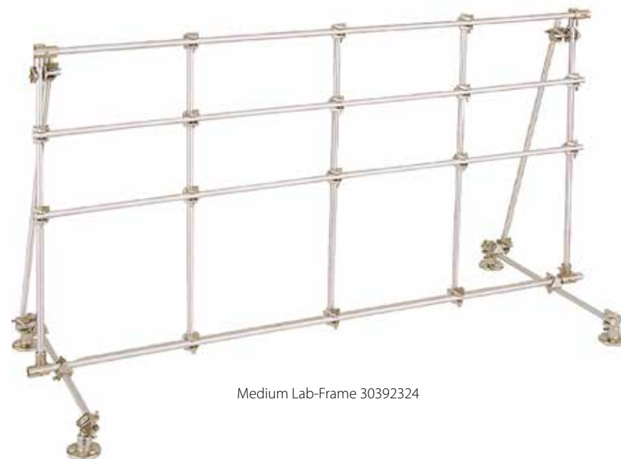
Medium Lab-Frame 30392324