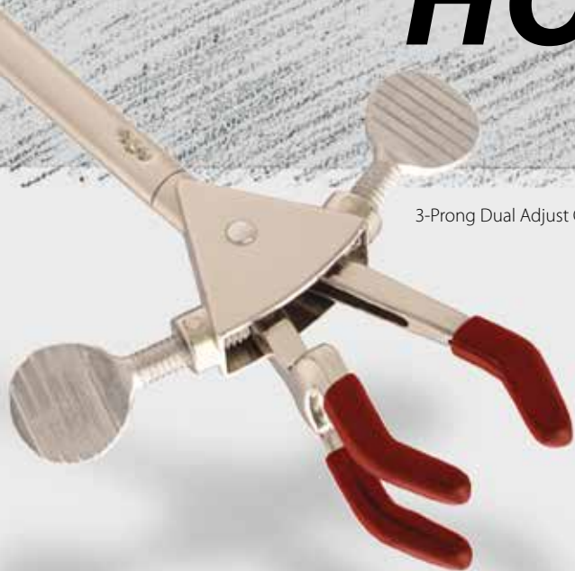
3-Prong Dual Adjust Clamp