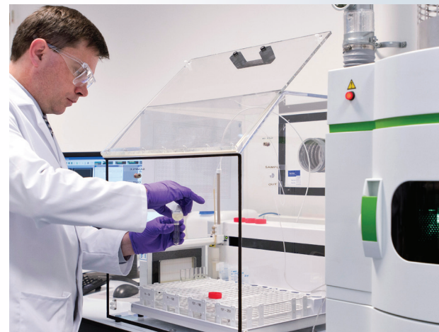
Atomic Emission Spectroscopy Analysis

With Honeywell's analytical reagents, superior quality and safety standards are a prime focus. We use a comprehensive Quality Assurance System in line with EN 29001 (ISO 9001) and each of our products is manufactured to clear, guaranteed specifications. We employ a large variety of modern analytical methods, such as inductively coupled plasma optical emission spectroscopy (ICP-OES), inductively coupled plasma mass spectrometry (ICP-MS), flame atomic absorption spectroscopy (AAS) and graphite furnace AAS (GF-AAS). This allows for specifically tailored control and analysis procedures for each product.