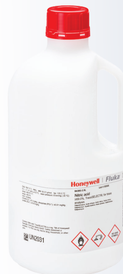
Honeywell Fluka - Nitric Acid TraceSELECT 84385-2.5L

The reduction of metals into mercury is more favourable than reduction to the solid-state electrode. Further on there is always a clean new Hg electrode surface available for each measurement.