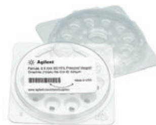
1/8 in 85% Polyimide/15% graphite, 0100-1332