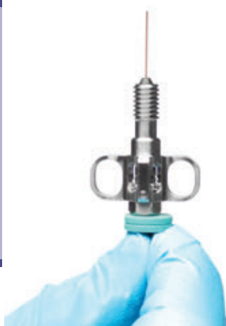
Self Tightening column nut