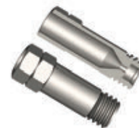
Column nut for long or long two-hole ferrules, 05921-21170

Pre-conditioned graphite/polyimide ferrules are recommended with MSD Interface nut