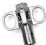
Self Tightening column nut, for MS interface, 5190-5233