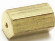
MS interface column nut, 05988-20066