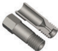
Universal column nut, 5181-8830

Standard fitting for Agilent GC inlet and detectors (FID, NPD, ECD) column connections use short ferrules and the Universal nut