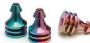
UltiMetal Plus Flexible Metal ferrules, G3188-27501