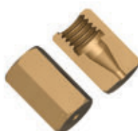
MS interface column nut, 05988-20066

Pre-conditioned graphite/polyimide ferrules are recommended with MSD Interface nut