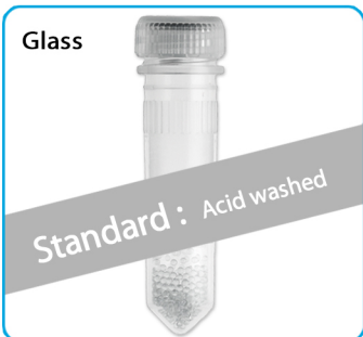
Standard Glass beads (Acid Washed)