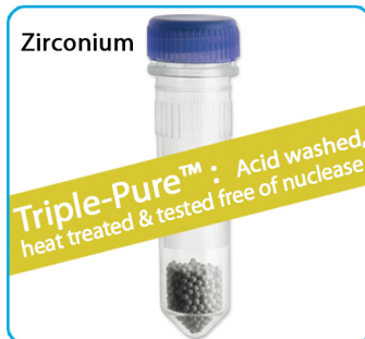
Triple-Pure™ (Molecular Biology Grade) Zirconium Beads